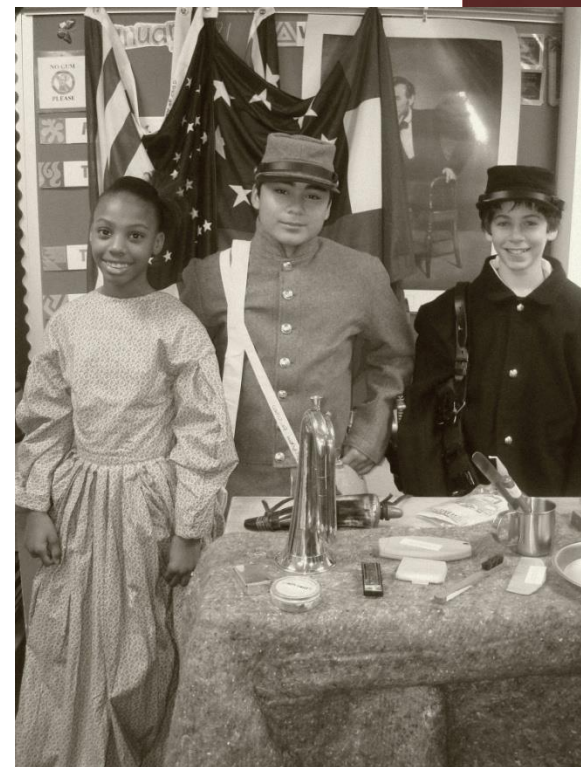
History Trunks Grant