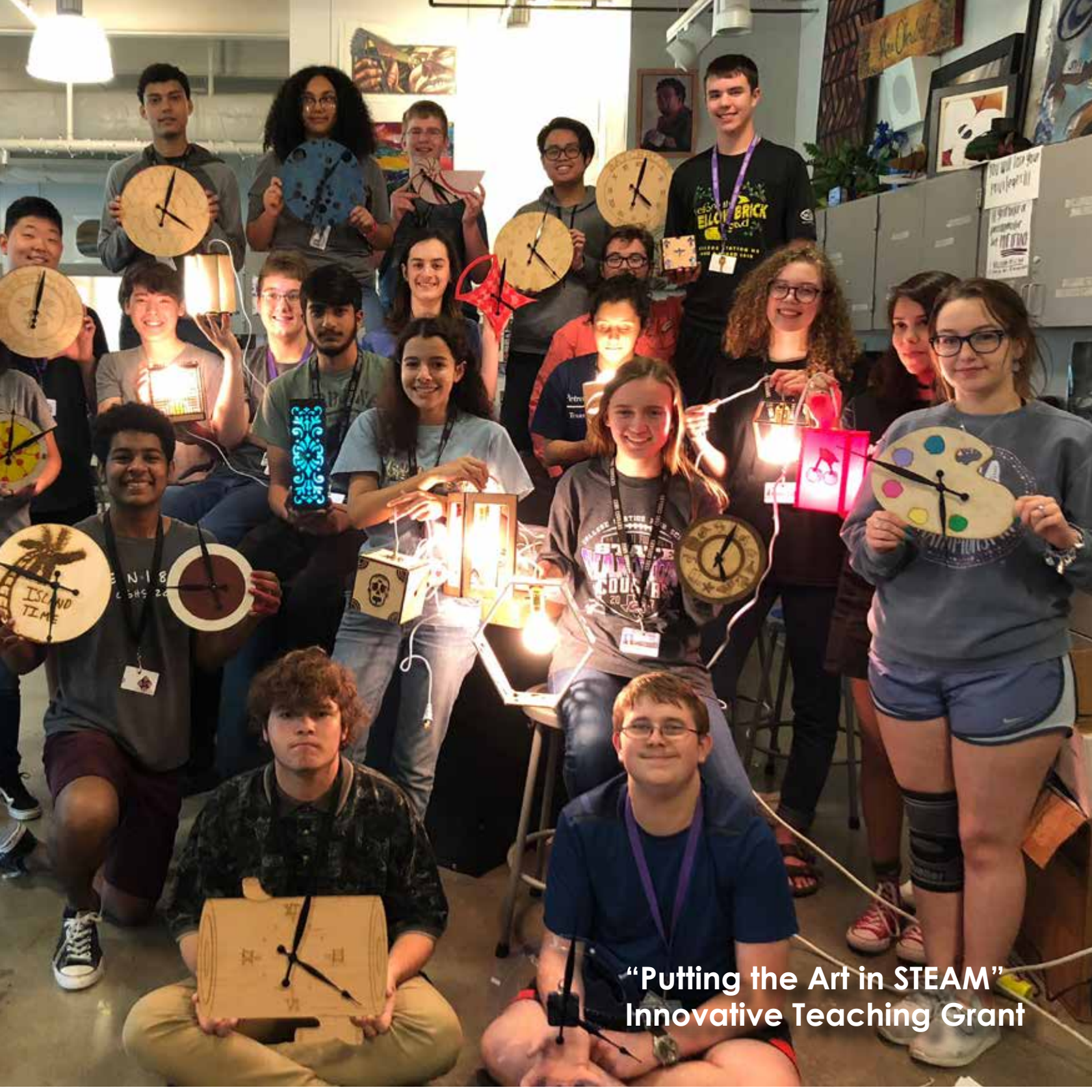
“Putting the Art in STEAM” Innovative Teaching Grant