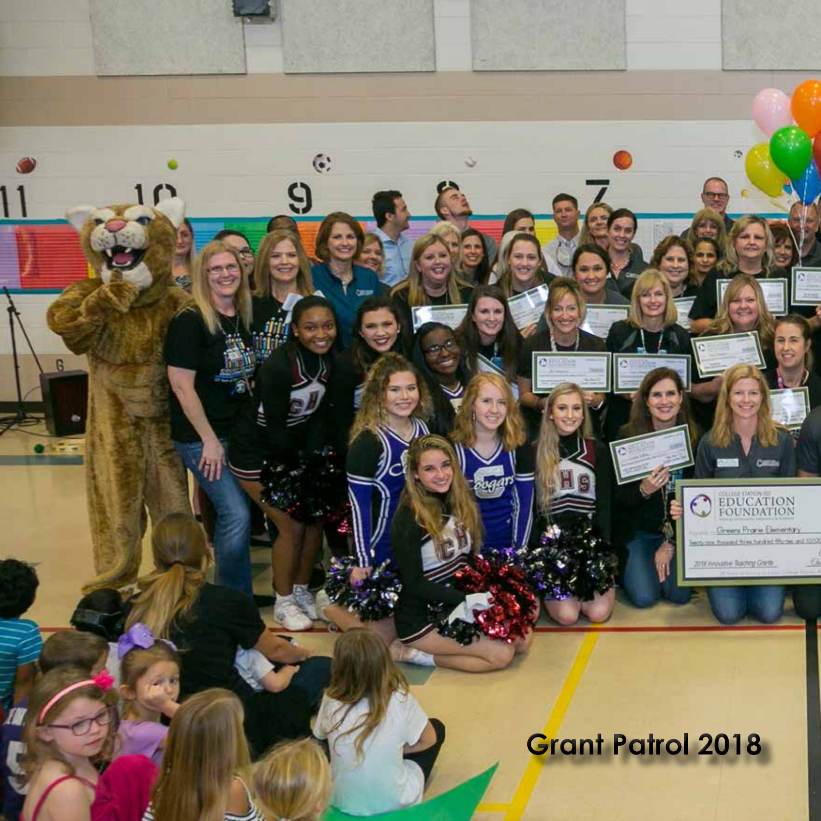
Grant Patrol 2018