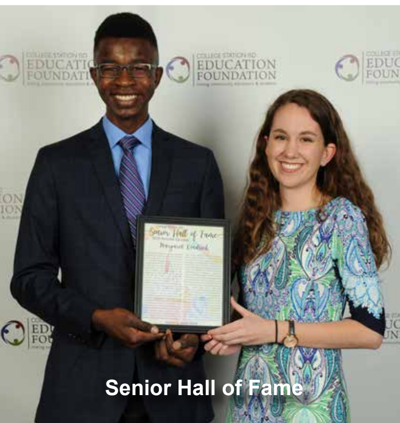
Senior Hall of Fame