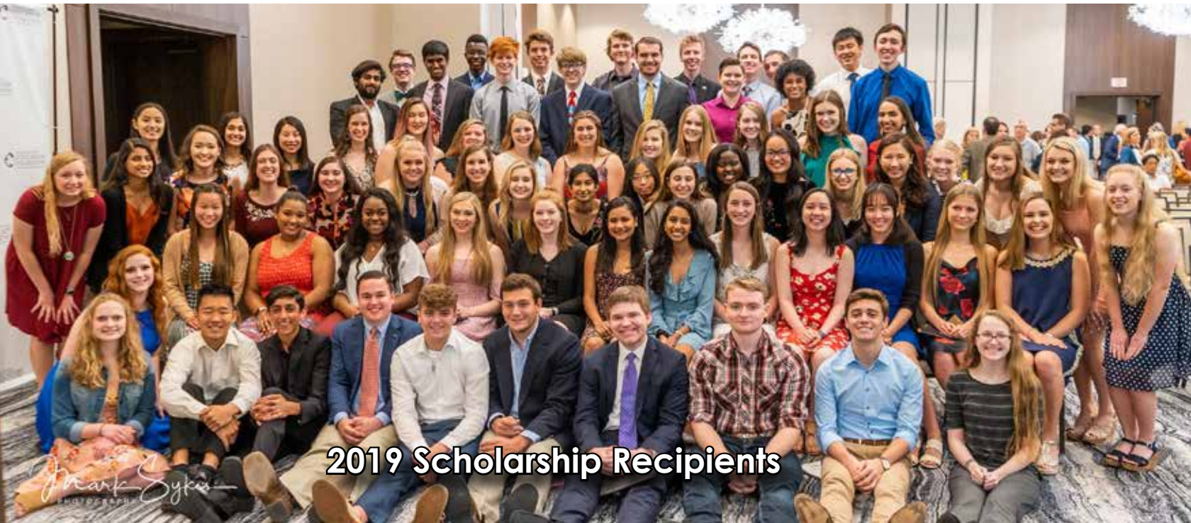
2019 Scholarship Recipients