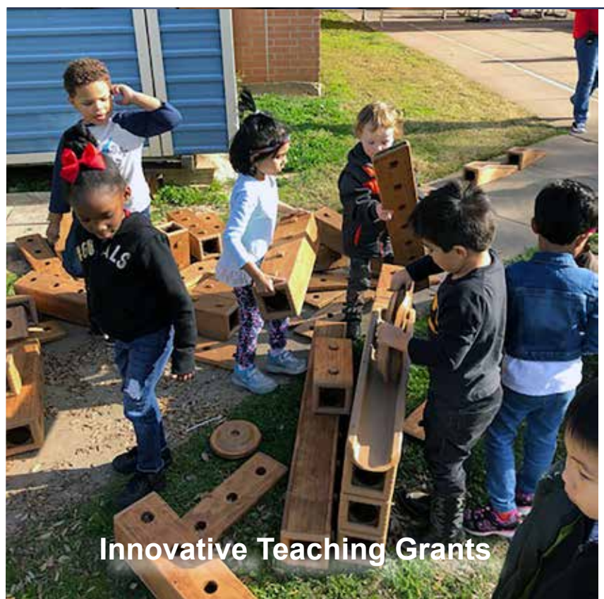
Innovative Teaching Grants