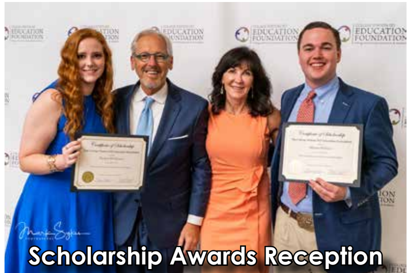
Scholarship Awards Reception