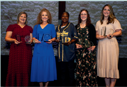
Annual Employee Awards