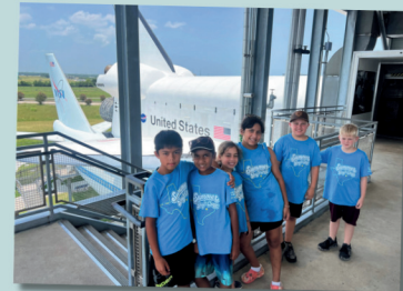
Summer Day Camp Scholarships

bridge the summer learning gap by providing summer enrichment