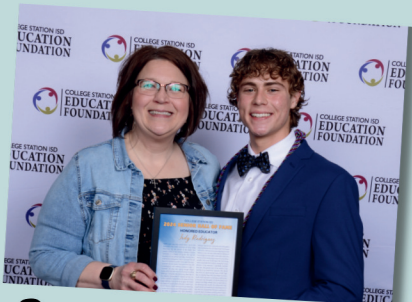
Senior Hall of Fame