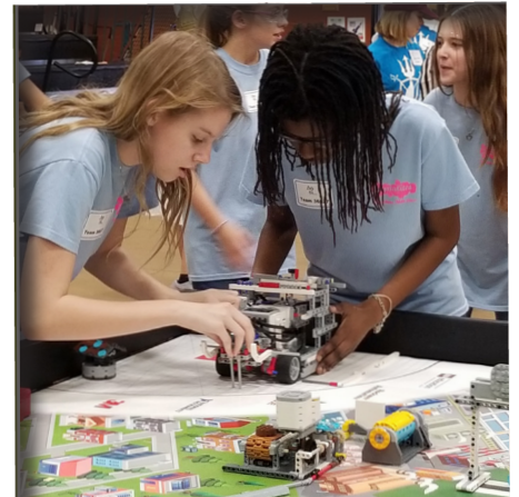
Innovative Teaching Grants